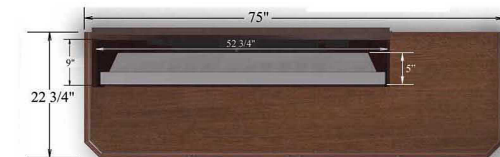
TOP VIEW (Closed)

Infrared relay system provides a window from your handheld remotes to your TV and audio components even though they are concealed inside the cabinet. No programming required!